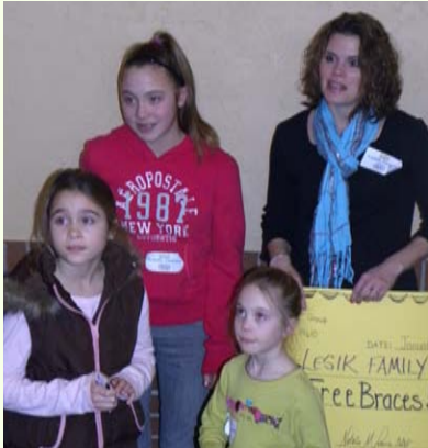
The Lesik Family