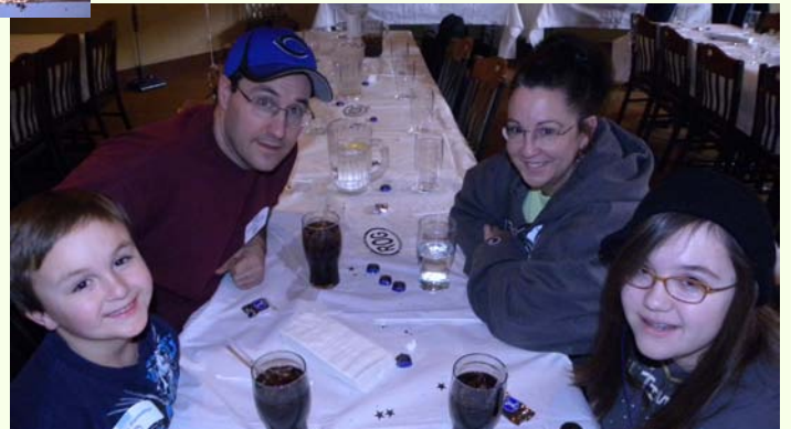
The Hauck Family