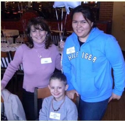
Big smiles representing the Fries Family